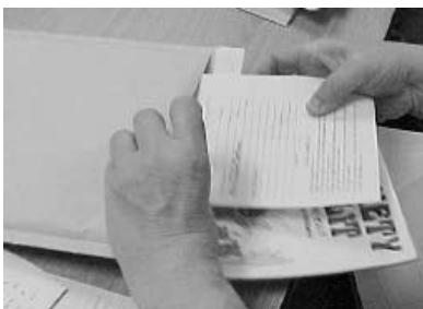
7. Book, tape and store order are stuffed in envelope and taken to mail