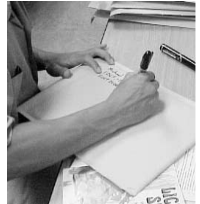
6. The envelope is addressed to the child or in care of parent or guardian.