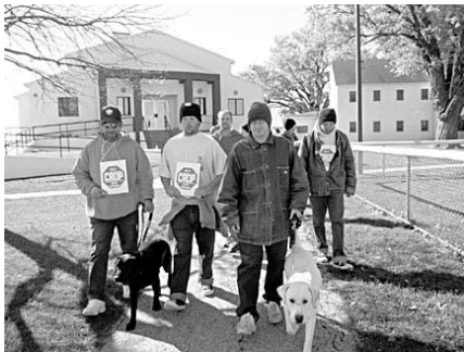
NCCF CROP Walkers

April to October giving in 2007: $286.00