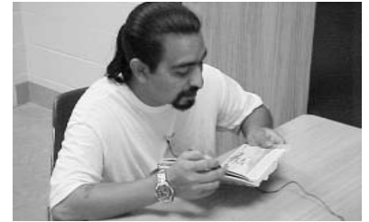
3. The father reads the book, recording it on cassette tape. A brief greeting may be given at the beginning and the end of the recording.