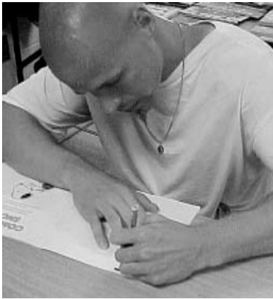
4. A brief message may be written in the front of the book.