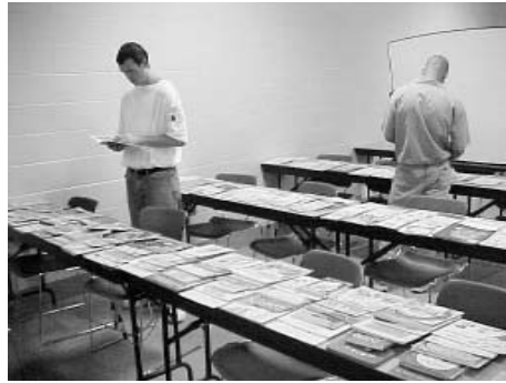
2. Fathers select books to read to their children. Books, cassettes and envelopes are donated by outside congregations and individuals.