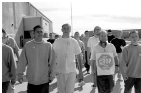
FDCF CROP Walkers