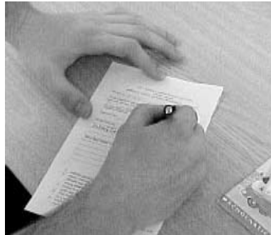
5. A store order is filled out, except for the amount of postage, and signed.