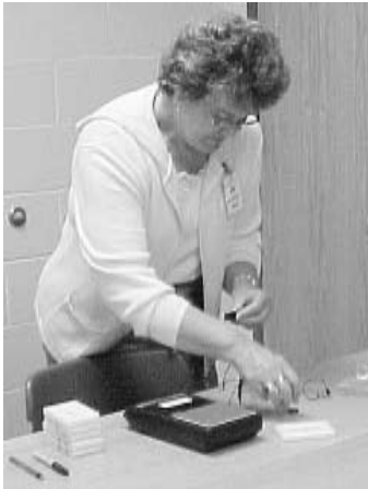
1. Volunteer "engineers" set up recorders before fathers arrive.